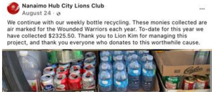
19-L Nanaimo Hub City Lions. Weekly Bottle Recycling