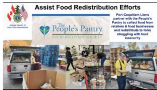
19-O Port Coquitlam Lions Redistribute Food

As the Environment Chairpersons circulate through our districts, speaking to Lions, scanning MyLion, Facebook pages & websites, these are some of the projects we see.